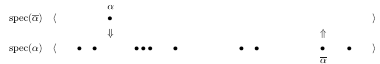
Figure B. By hypothesis, either \alpha \in \text{spec}(\bar{\alpha}) , or \bar{\alpha} \in \text{spec}(\alpha) . Here \alpha is not in \text{spec}(\bar{\alpha}) , so \bar{\alpha} must be \text{spec}(\alpha) .